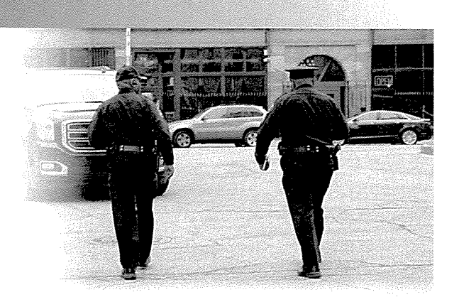
July 2, 2020